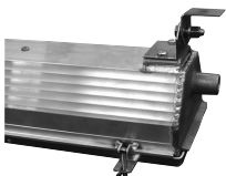
AMK = Adjustable Mounting Kit